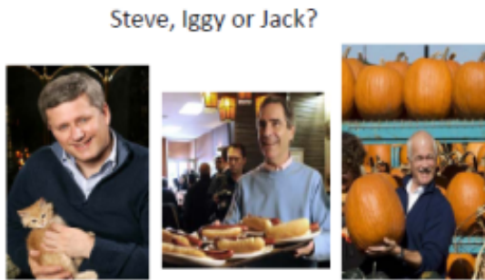
For Whom would you vote?